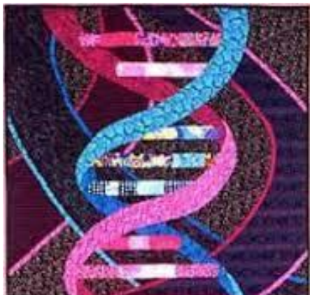
National DNA Day April 25 th