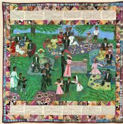
National Picnic Day April 23 rd